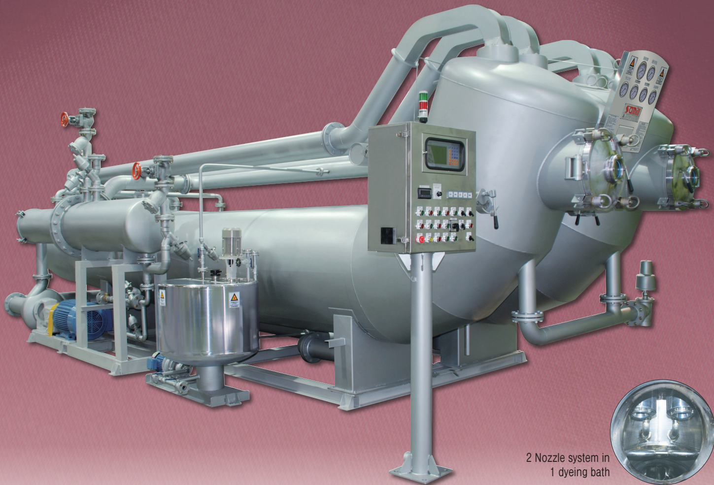
2 Nozzle system in 1 dyeing bath